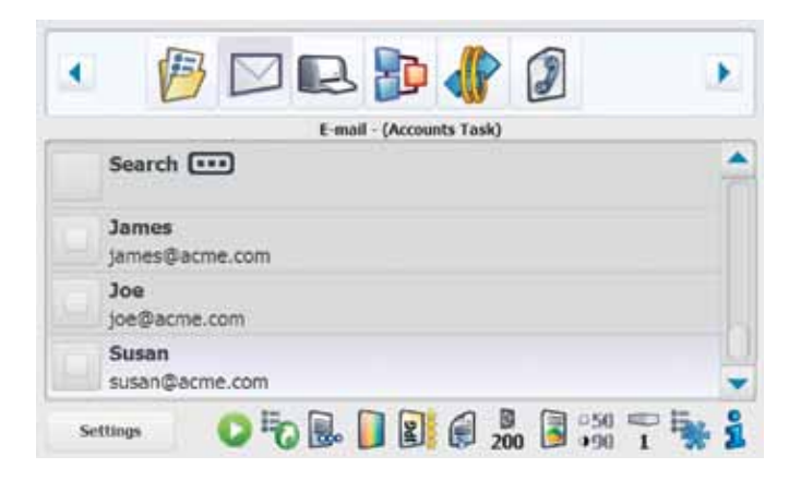
The large 20.3\,\mathrm{cm} LCD touchscreen makes it easy for everyone to scan and share.